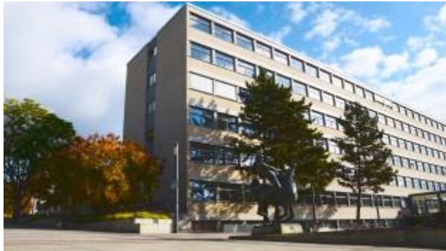
Dolivo-Dobrovolsky building (TU Darmstadt)